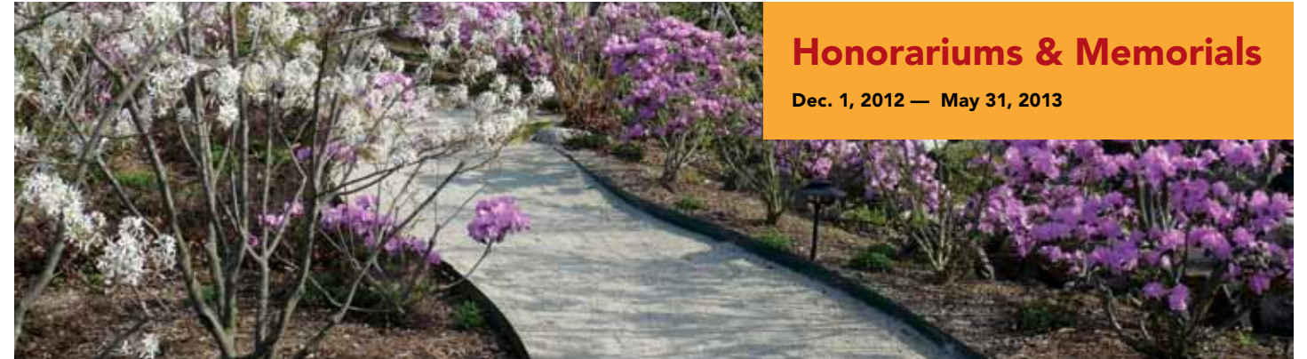
Rosecrance Griffin Williamson Campus