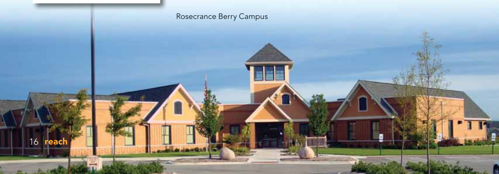
Rosecrance Berry Campus

MCHEMRY COUNTY: Rosecrance McHenry County provides outpatient treatment for youth with mental health issues.