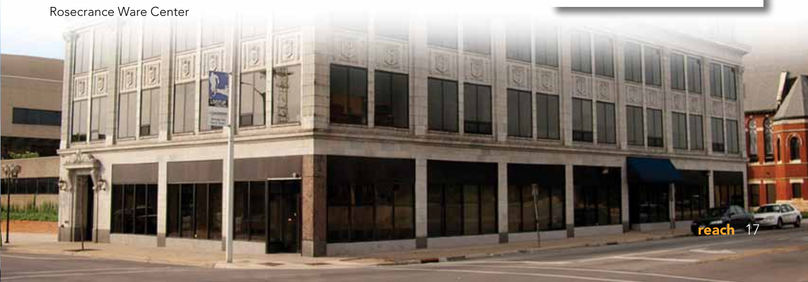
Rosecrance Ware Center

Rosecrance Belvidere Clinic is a full-service outpatient mental health clinic serving individuals in the greater Boone County area.