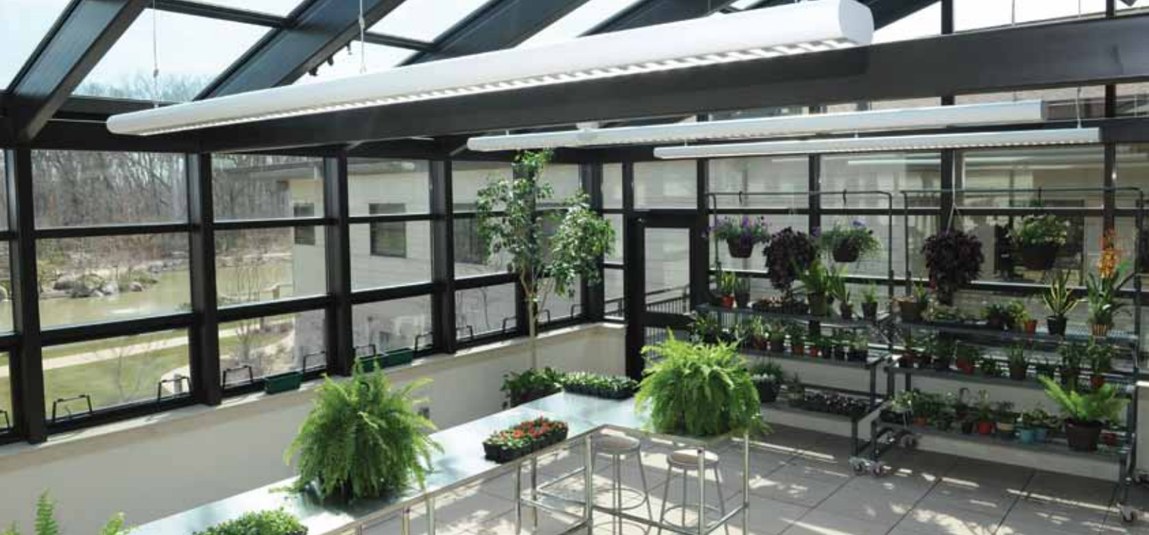
The Ipsen Conservatory at the Rosecrance Griffin Williamson Campus is state-of-the-art and dedicated to horticultural therapy for adolescents in treatment.